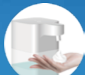
HE-406B (500ml, rechargeable)